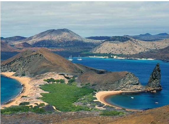
Galápagos Islands, Ecuador

Ecuador, located in the heart of South America with a surface area of 256,370 km 2 and population of almost 13.5 million, has many natural and cultural resources that qualify it as a country of great diversity. The main source of wealth is in particular the Reservations of Natural Areas and the biodiversity that these contain. We have 35 natural reservations, including the Insular Reservation of Galápagos, and Loja city, which is located in the south of Ecuador, deeply embedded in the Amazon region with its Podocarpus National Park and a diversity of plant species that attracts naturalists from around the world.