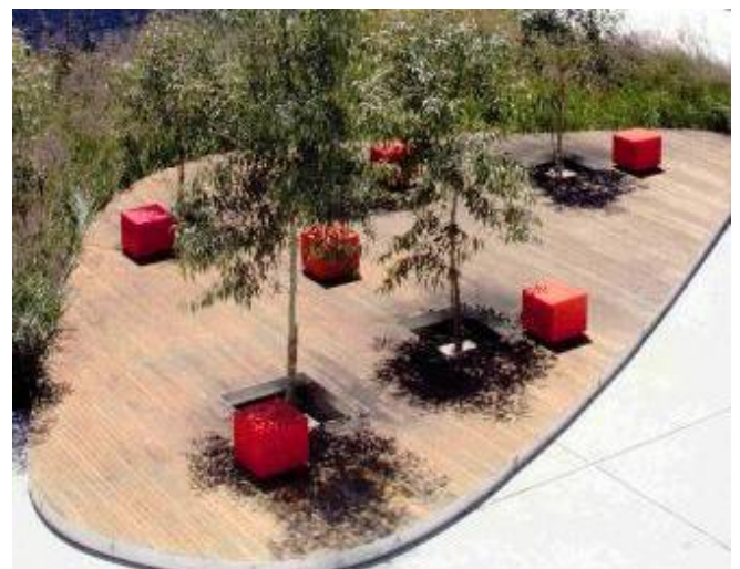
Kstov: ...bright red forms reminiscent of strawberries

For Kstov the main criteria for our new scenario were to avoid the use of industrial symbols. As a foundation for new local landmarks we used bright red forms reminiscent of strawberries which would remind people of the origin of the city's name: Kstov, or in the old Russian language "ksta", means strawberry. The theme of "ksta" with its bright colour was adequate to create a very active and dynamic environment of the young city where the majority of the population is only 25-40 years old. The foundation of the project was to form multifunctional public spaces. Unused open urban spaces were united in one system aimed at enhancing the current poor network of green areas and improving the ecological situation in the city.