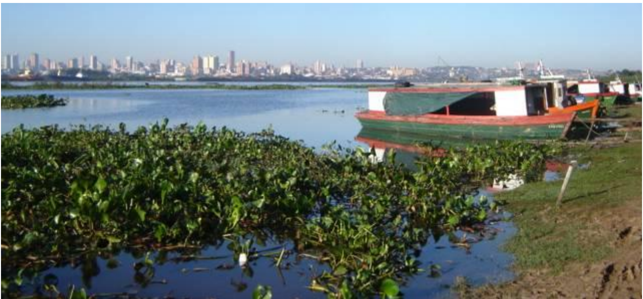
Asunción City from the Paraguay River

To achieve our goals it will be fundamental to be part of IFLA, to learn from the experiences of our colleagues, and to grow with your support. Thank you.