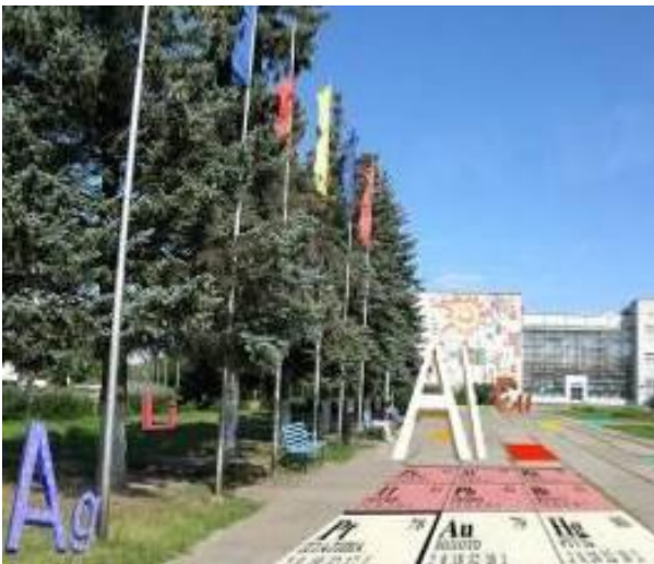
Dzelzhinsk: ...symbols of Chemistry as a science were logically incorporated into the urban environment

Uniqueness and preciseness of urban structure was used at several levels. Firstly, a continuous system of green boulevards was connected with main green nodes and waterfront boulevards to create an integrated urban ecosystem.