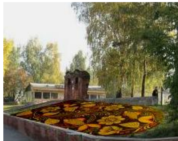
Semenov: ...bright floral arrangements based on Khokhloma decorations

For the most historically rich and remote city of Semenov, there were a number of advantages: the ecological unpolluted environment, the folk craft Khokhloma, and the ancient distinctive history. The main task for this city was using the folk symbols in urban spaces, and the preservation of the existing space and pastoral image. We introduced bright floral arrangements based on Khokhloma decorations. Native coniferous trees that are typical for the northern forest of Nizhniy Novgorod were also introduced into the city. Our project fostered the preservation of the existing vernacular way of life.